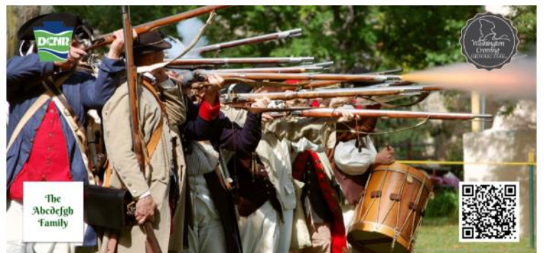
The Abcdefgh Family