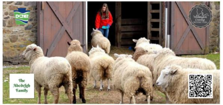
The Abcdefgh Family