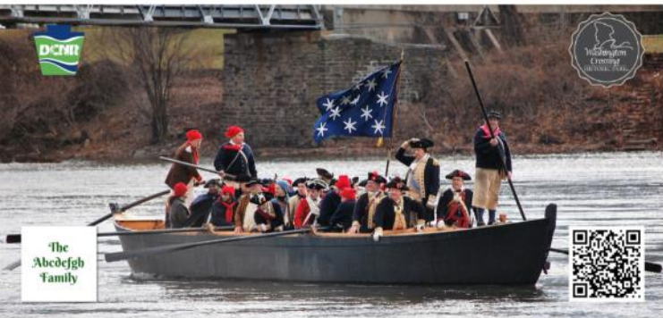
The Abcdefgh Family