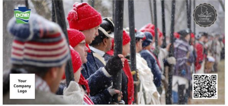
Your Company Logo