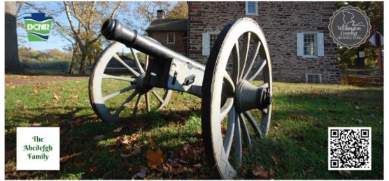
The Abcdefgh Family