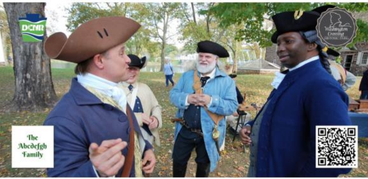
The Abcdefgh Family