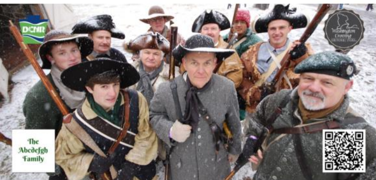
The Abcdefgh Family