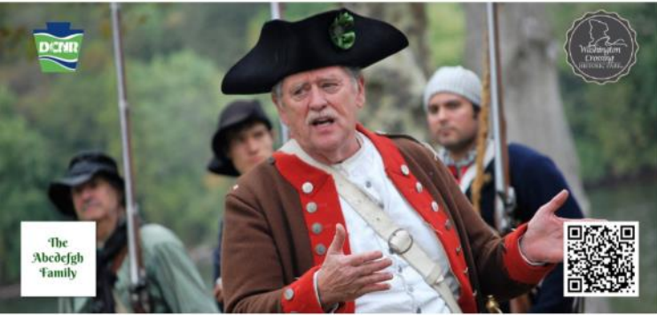
The Abcdefgh Family