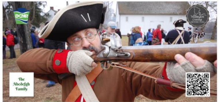
The Abcdefgh Family