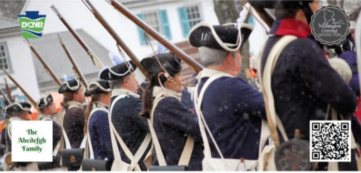
The Abcdefgh Family